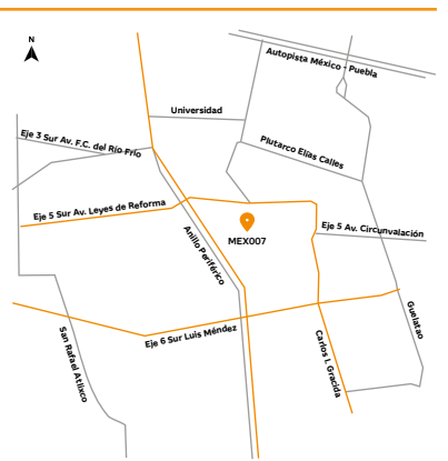
Michoacán 20, Nave 16, Finsa Iztapalapa, CDMX, CP 09209