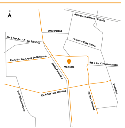
Michoacán #20 Nave 8A, Iztapalapa, CDMX, C.P. 09209